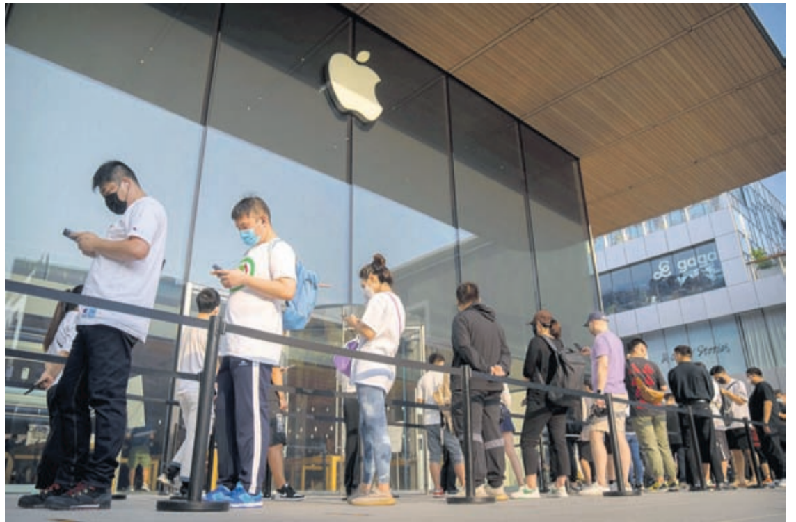
Customers line up outside of an Apple Store before its opening on the first day of sale for the Apple iPhone 14 in Beijing, China on Sept. 16, 2022. Apple Inc. is warning customers will have to wait longer to get its latest iPhone models after anti-virus restrictions were imposed on a contractor's factory in central China.

In a post on the Zhengzhou plant's WeChat social media account Sunday, the company said a "closed